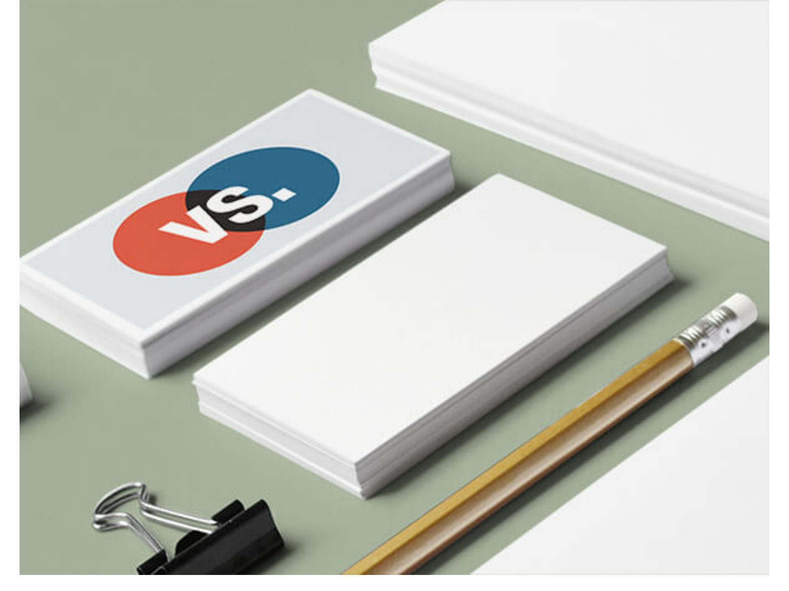
Mutual Funds vs. ETFs

Exchange-traded funds have some things in common with mutual funds, but there are differences, too.