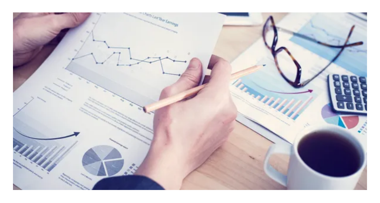
Committed to Service

We use proven finance strategies designed to meet your risk tolerance and stand up against market volatility. And you can count on unbiased recommendations and impartial guidance based directly on your needs and goals.