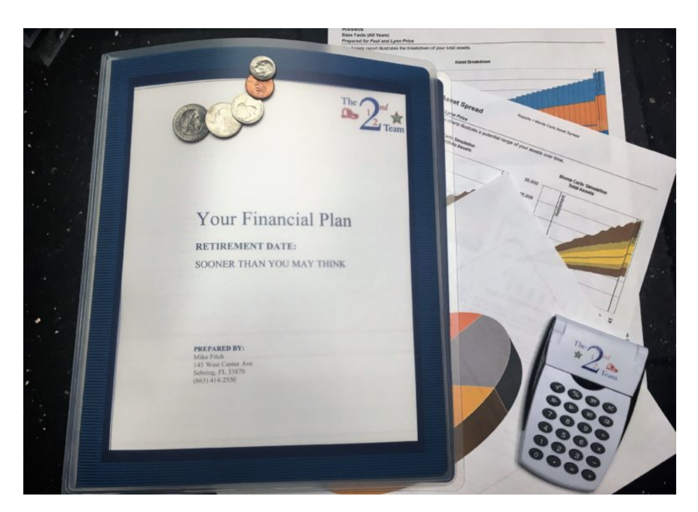
No Cost, No Obligation Financial Plans (https://www.secondhalfteam.com/contact/)

Currently serving First Responders at 150+ departments around Florida – and counting.