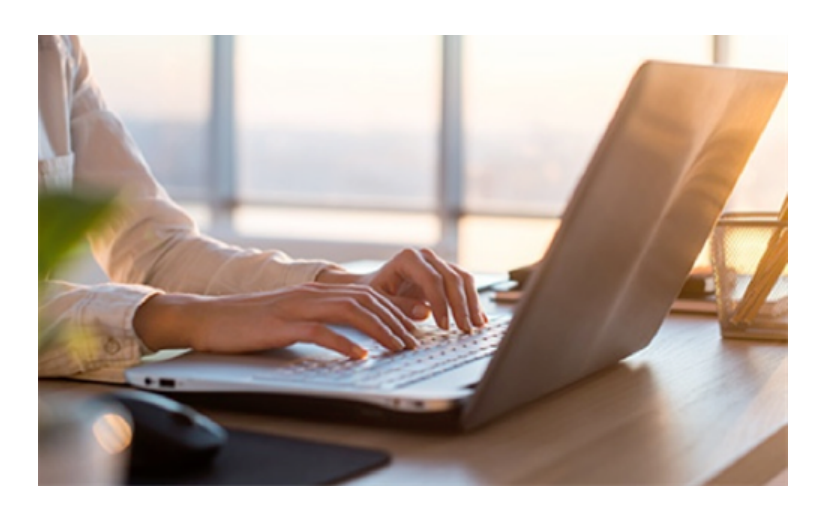
Individuals & Families

Our first priority is helping you take care of yourself and your family.