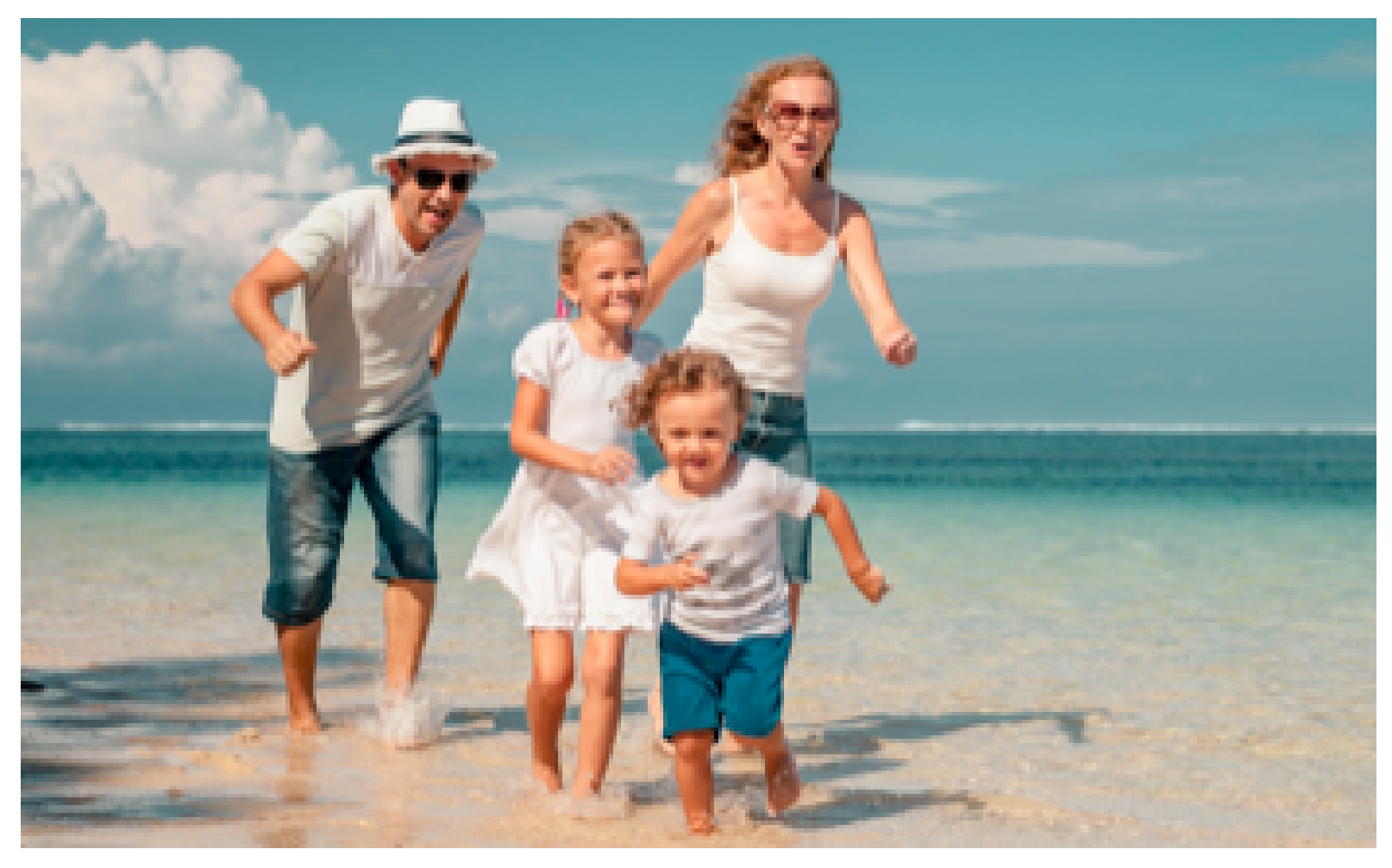
Personal Financial Services