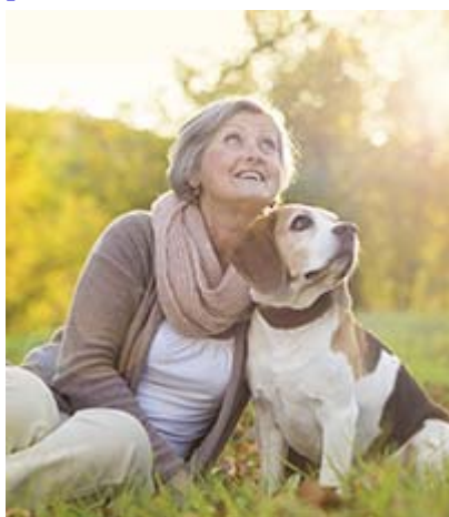
( https://www.keenwealthadvisors.com/resource-center/estate ) LOSING A SPOUSE