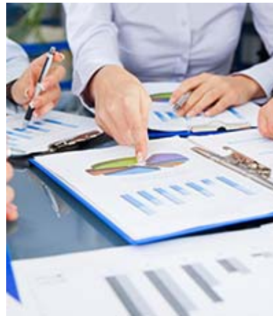
( https://www.keenwealthadvisors.com/resource-center/estate ) ESTATE STRATEGIES