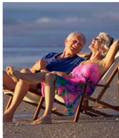
( https://www.keenwealthadvisors.com/resource-center/retirement/saving-for-retirement ) RETIREMENT LIFESTYLE