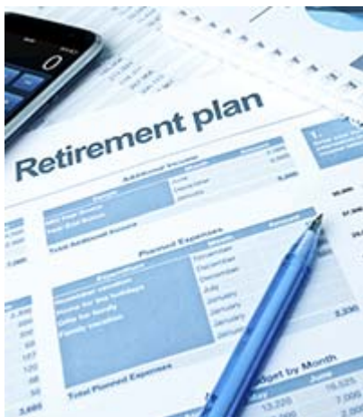
( https://www.keenwealthadvisors.com/resource-center/estate/whats-my-potential-estate-tax ) LEAVING A LEGACY