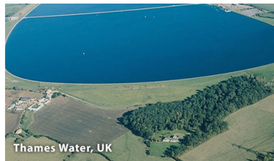
Thames Water, UK