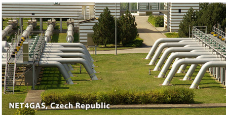
NET4GAS, Czech Republic