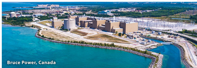
Bruce Power, Canada