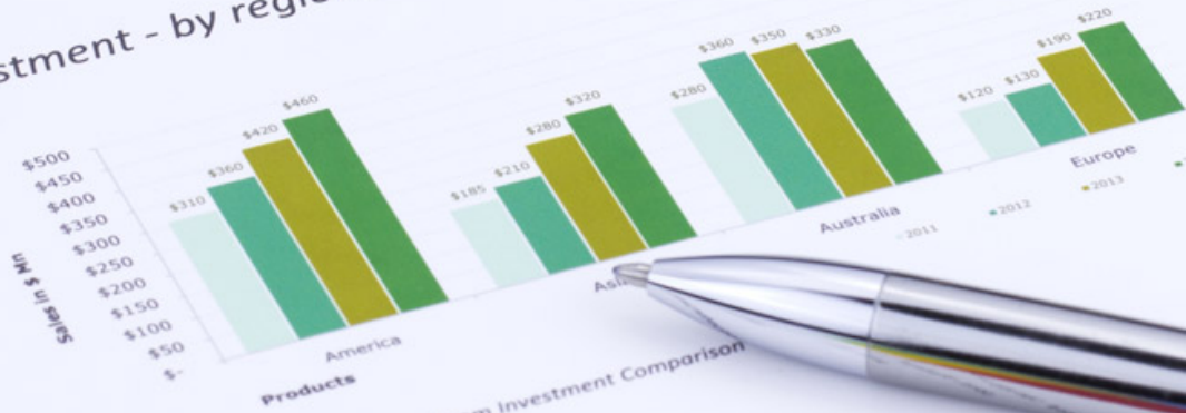
Chart 1: 5-year Performance from Investment Comparison