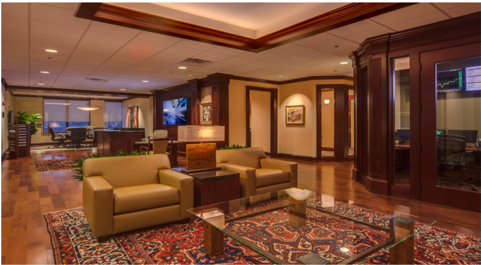
MEET THE TEAM