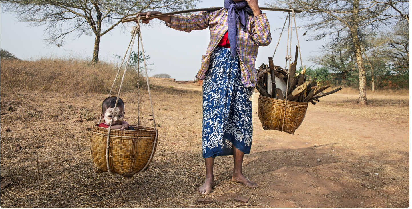
( https://creationinvestments.com/wp-content/uploads/2018/12/Always-with-a-Mother-Myanmar.jpg ).