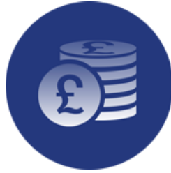
UK Economy Briefing