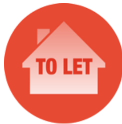
UK Buy-To-Let Briefing