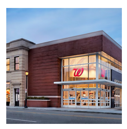
Net Leased Real Estate