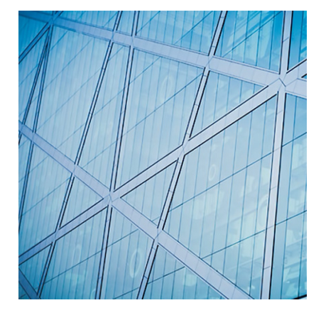
CRE Debt Securities