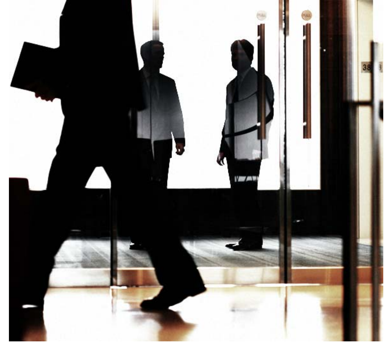
Headquartered in Minneapolis, we tailor our boutique services to meet your needs and goals.