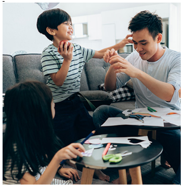
Individuals & Families