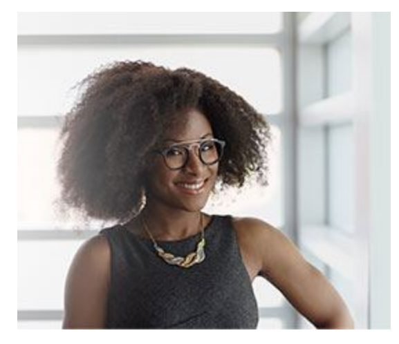
What Every Woman Should Know About Long-Term-Care