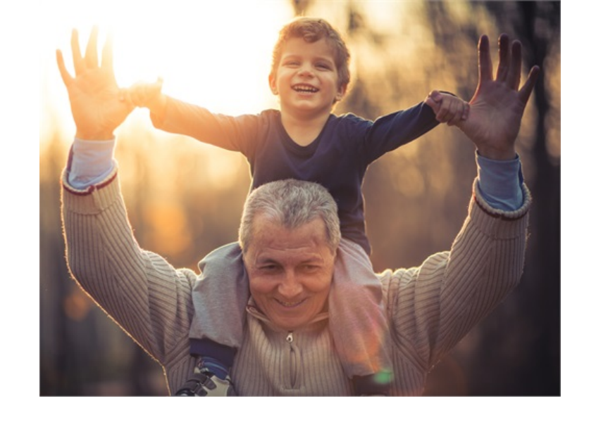
HOLISTIC DI ANNING

Our value lies in coordinating all aspects of your plan, which is why we provide comprehensive wealth