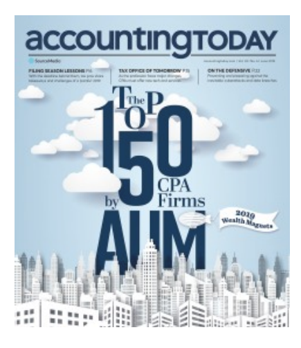
June 13 2019