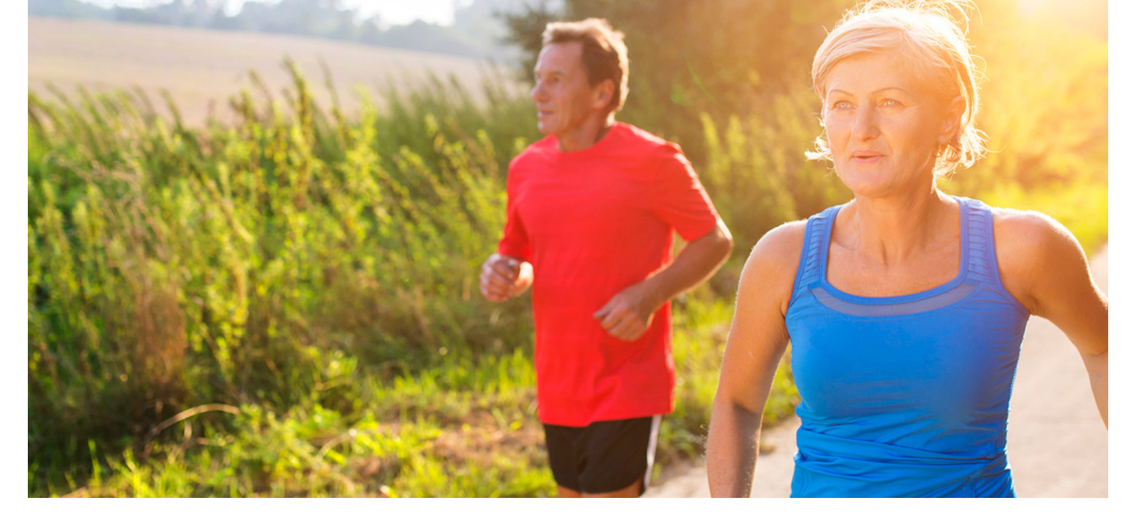
Investing is a Marathon: Stay Focused as Trade Wars Escalate JUNE 7, 2019