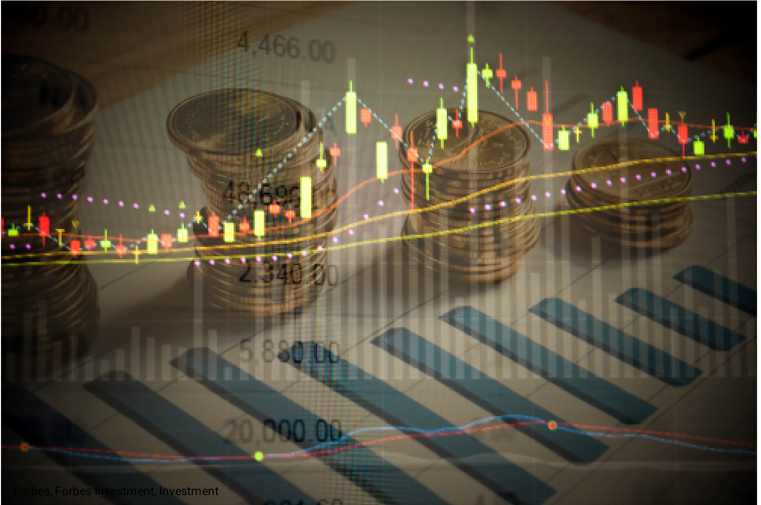
Forbes, Forbes Investment, Investment