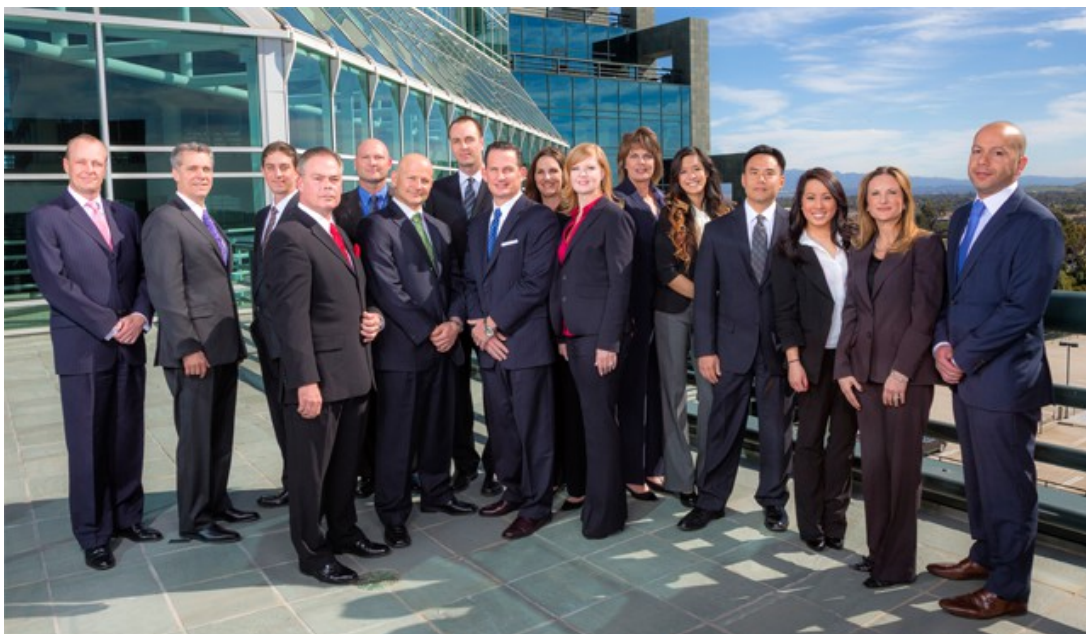
The CFG & Pacific Financial Group Team

administrative support at the Executive level. In November 2005 she left PIMCO, a large Investment Management Firm in Newport Beach to focus on her family. At CFG she works hard to provide exceptional customer service and administrative support to all of CFG's clients.