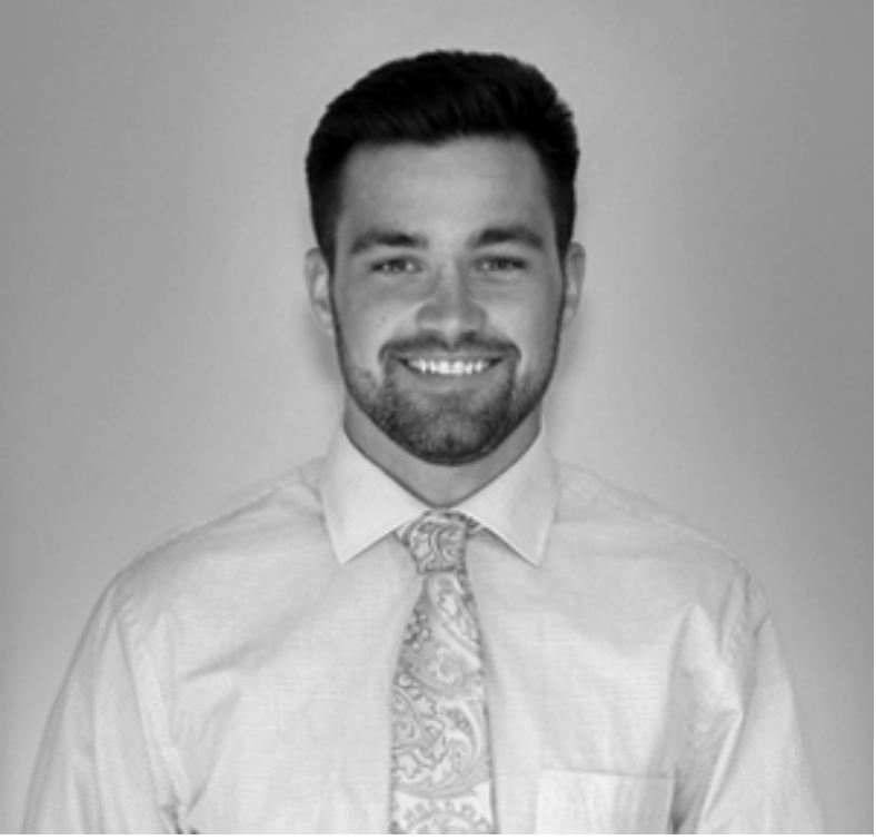
( https://www.financialsymmetry.com/our-team/colton-tickle/ )