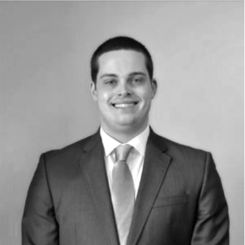
( https://www.financialsymmetry.com/our-team/garrick-king/ )