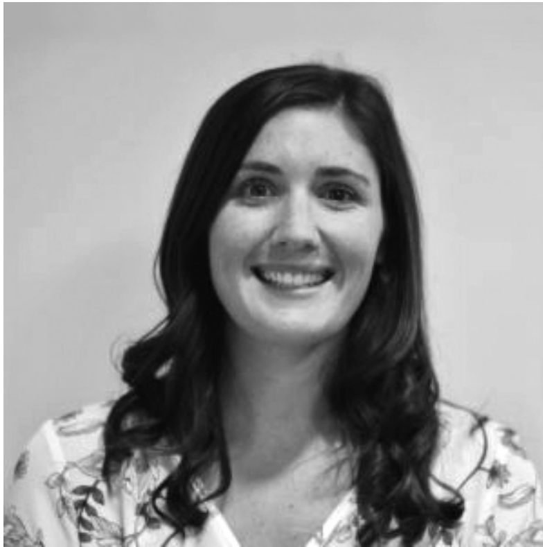
( https://www.financialsymmetry.com/our-team/sam-knighton/ )