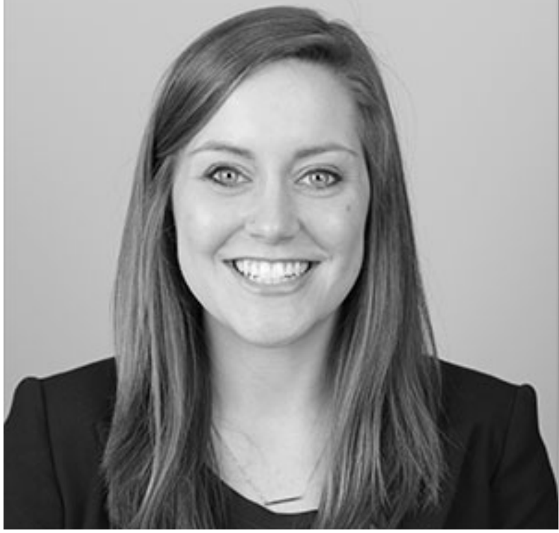
( https://www.financialsymmetry.com/our-team/haley-modlin/ )