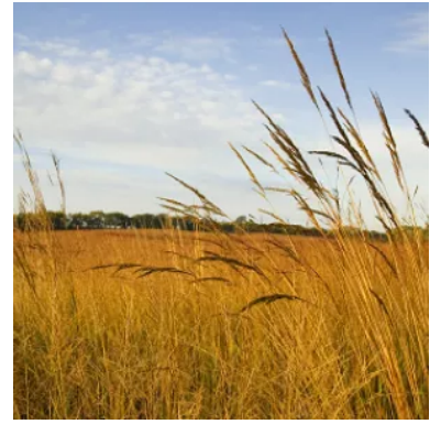
Non - Profit Endowments