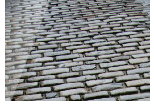
Our 7 Promises