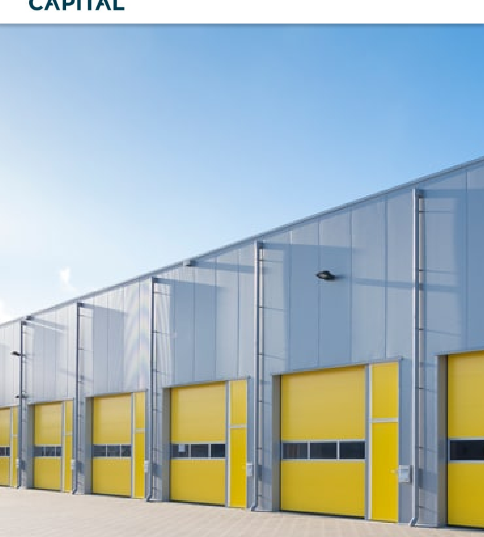
GLOBAL PROPERTY SECURITIES FUND (UNHEDGED) - SERIES