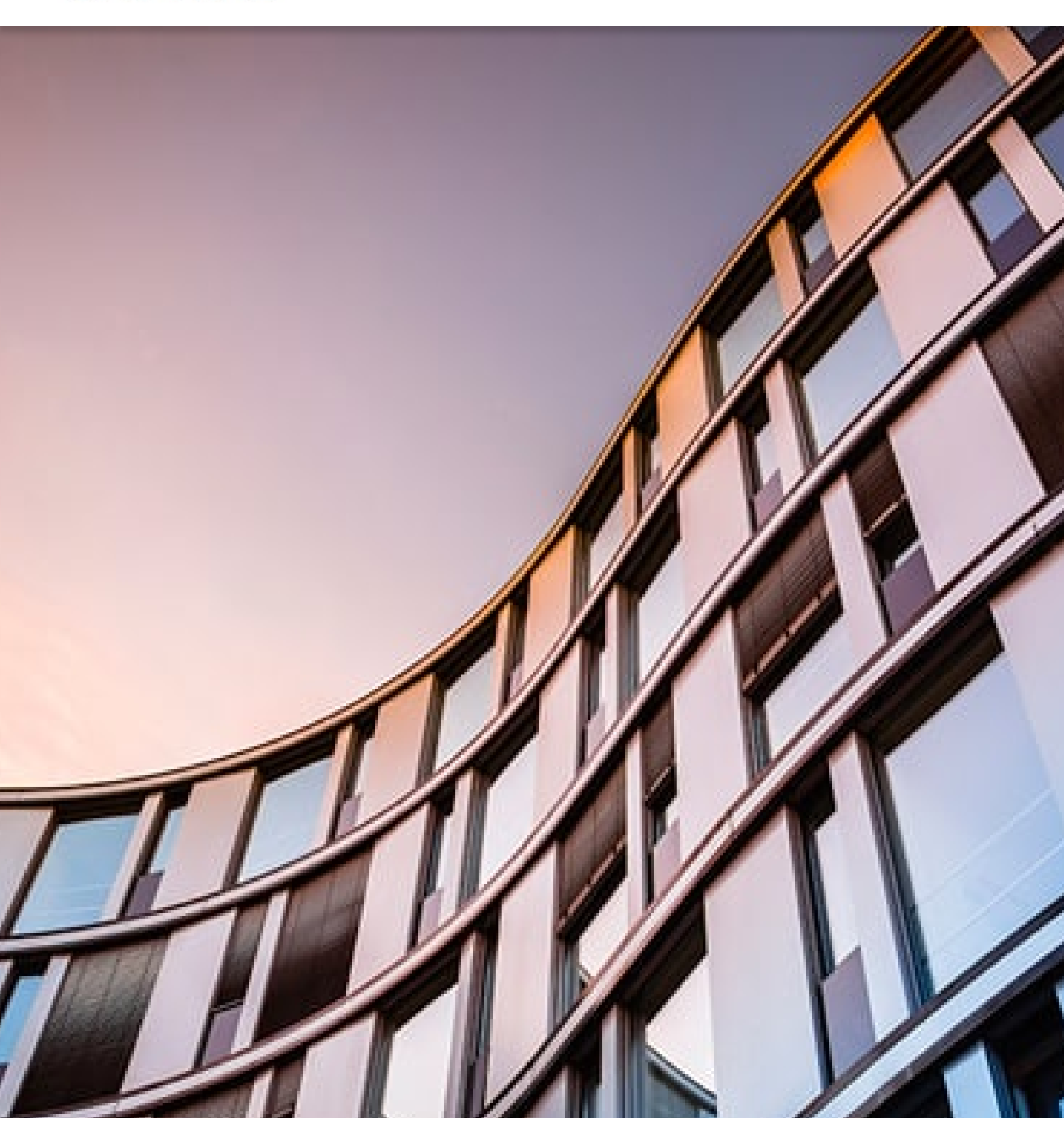
GLOBAL PROPERTY SECURITIES FUND - SERIES II