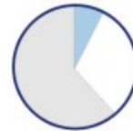
Knowledge Leaders Developed World ETF