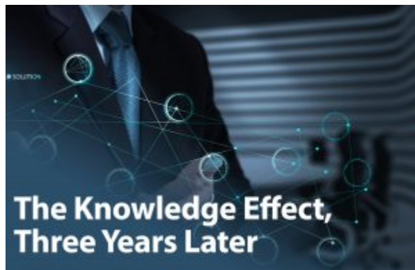
First live market test confirms the academic research; 2018