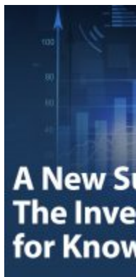
The market size, quality, and return for knowledge