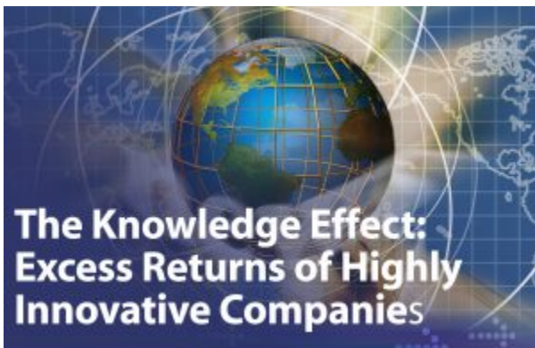
The academic foundations of this market anomaly; 2015