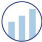
KL Allocation Fund