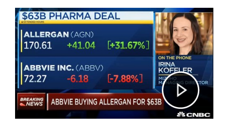
Not Surprising Allergan is Getting Acquired Now, Says