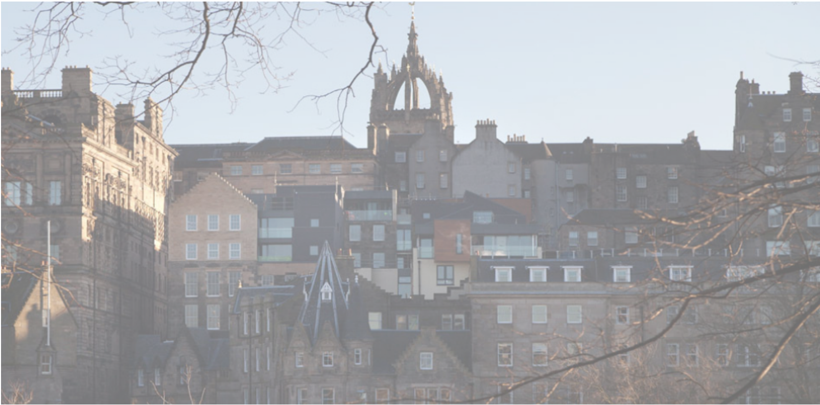
Advocate's Close, Edinburgh, UK