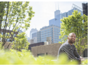
Gerding Edlen in the News

CREATING VIBRANT AND SUSTAINABLE PLACES FOR PEOPLE