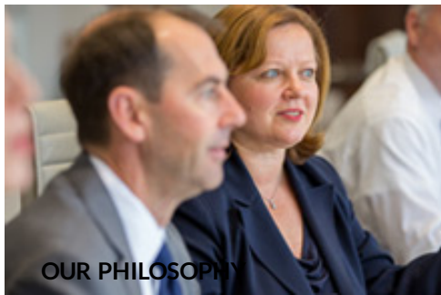
OUR PHILOSOPHY (/DIFFERENCE)

Spruceview collaborates with clients to solve their unique challenges. With expertise across every facet of institutional investment management, we deliver customized solutions created specifically for each client's nuanced needs.