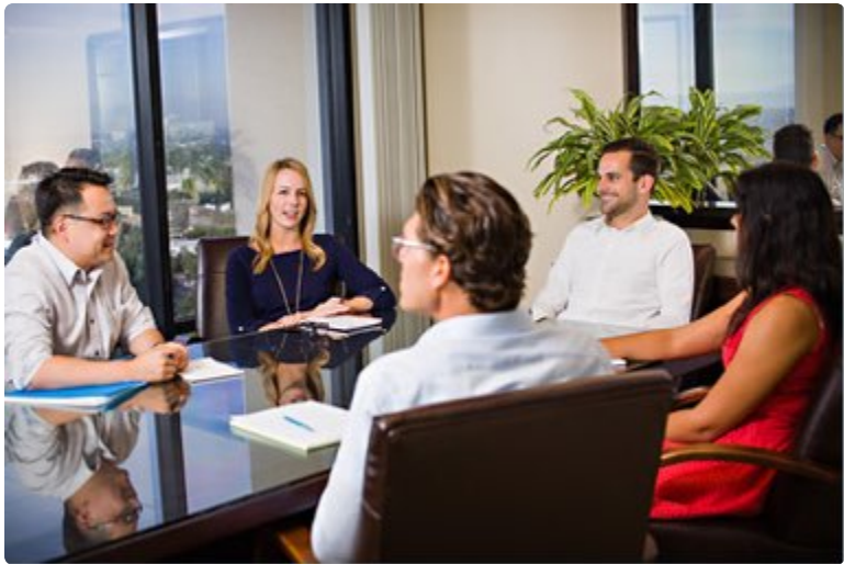
GREEN STREET CAREERS