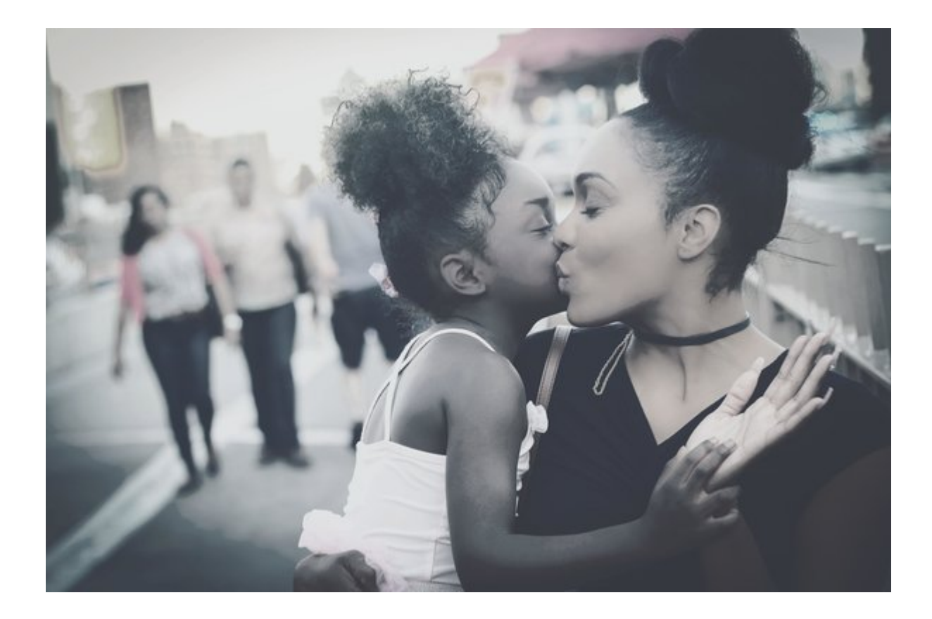
Balancing Work & Family