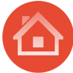
UK Housing Market Briefing