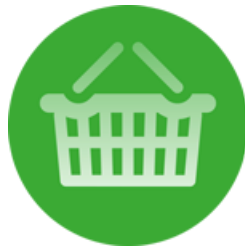
UK Household Cash Flow Briefing