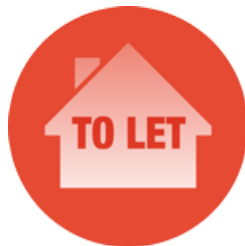
UK Buy-To-Let Briefing