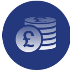
UK Economy Briefing