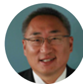
President & CEO

MEET THE TEAM (/about/meet-the-team.html)