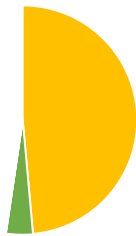
U.S. Domestic Composite 2019-July

● Equity (92.5%) ● Fixed-Income (7.5%) ● Cash (0.0%)