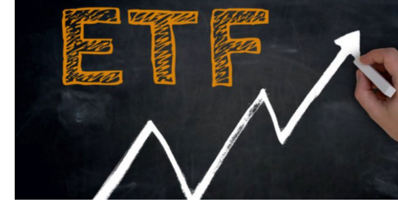
ARE SMART BETA ETFS ACTIVE OR PASSIVE?

Factor investing uses a set of easily definable characteristics to produce a universe of stocks that meet certain criteria. Factor investing uses a set of easily definable characteristics to produce a universe of stocks that meet certain criteria. Factor investing uses a set of easily definable characteristics to produce a universe of stocks that meet certain criteria. Factor investing uses a set of easily definable characteristics to produce a universe of stocks that meet certain criteria. Factor investing uses a set of easily definable characteristics to produce a universe of stocks that meet certain criteria. Factor investing uses a set of easily definable characteristics to produce a universe of stocks that meet certain criteria. Factor investing uses a set of easily definable characteristics to produce a universe of stocks that meet certain criteria. Factor investing uses a set of easily definable characteristics to produce a universe of stocks that meet certain criteria. Factor investing uses a set of easily definable characteristics to produce a universe of stocks that meet certain criteria. Factor investing uses a set of easily definable characteristics to produce a universe of stocks that meet certain criteria.