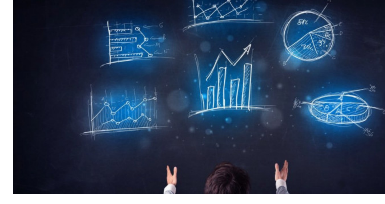
BUILDING A DIVERSIFIED PORTFOLIO WITH FACTOR INVESTING

Asset class investing has long been accepted as the key to building portfolios that allow investors to meet their long te diversifying investments between a wide range of asset classes such as large U.S. stocks, emerging market stocks, bonds capture returns in a variety of different market conditions,