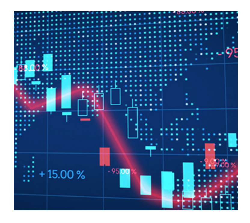
Managing Emerging Risks