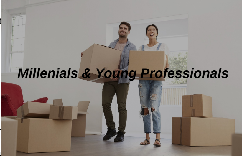
Millenials & Young Professionals

Strategic Partnering (https://www.strat-wealth.com/strategic-partnering/)