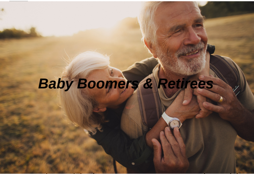
Baby Boomers & Retirees

StratWealth has served the unique needs of an extremely diverse client base for over 25 years. Our team provides comprehensive strategies to serve the determination to serve others to make lives better.