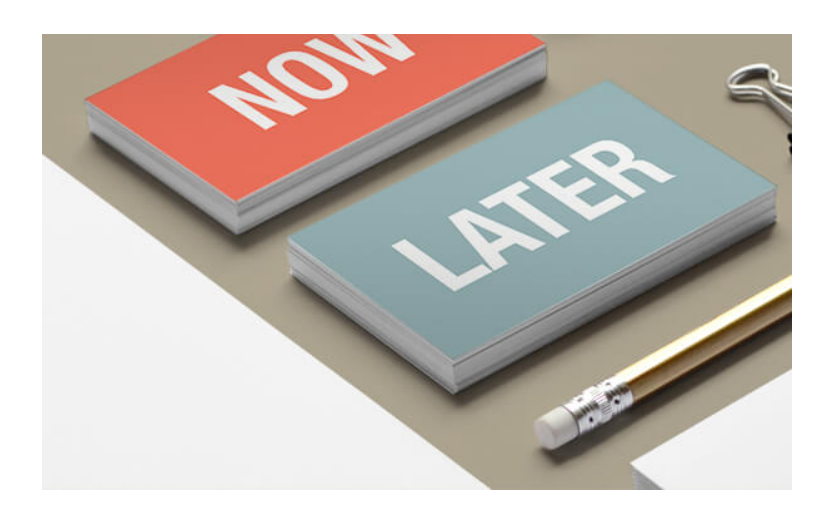
The Cost of Procrastination

Don't let procrastination keep you from pursuing your financial dreams and goals.