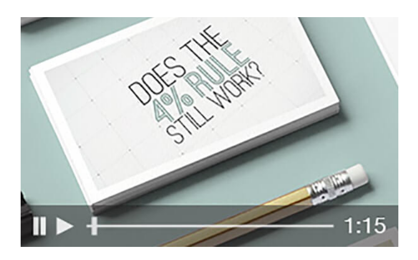
Retiring the 4% Rule

A portfolio created with your long-term objectives in mind is crucial as you pursue your dream retirement.