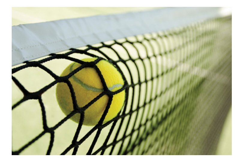
WINNING BY NOT LOSING By Anne Mette de Place Filippini