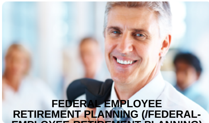
FEDERAL EMPLOYEE RETIREMENT PLANNING (/FEDERAL- EMPLOYEE-RETIREMENT-PLANNING)