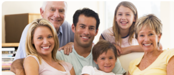
INSURANCE PLANNING (/INSURANCE-PLANNING)