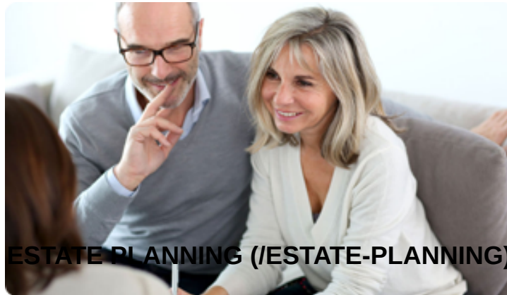
ESTATE PLANNING (/ESTATE-PLANNING)