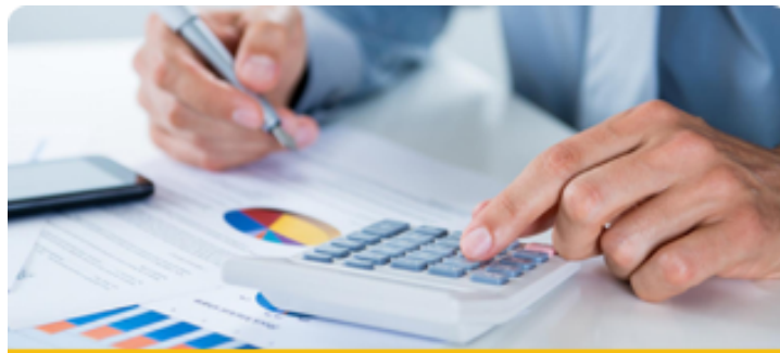
TAX PLANNING (/TAX-PLANNING)