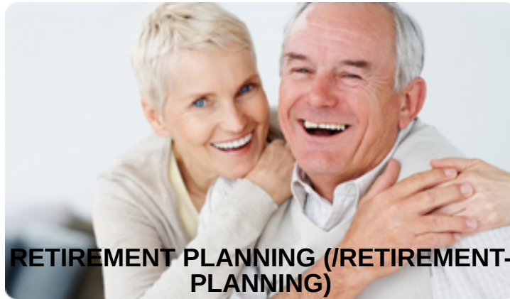
RETIREMENT PLANNING (/RETIREMENT-PLANNING)