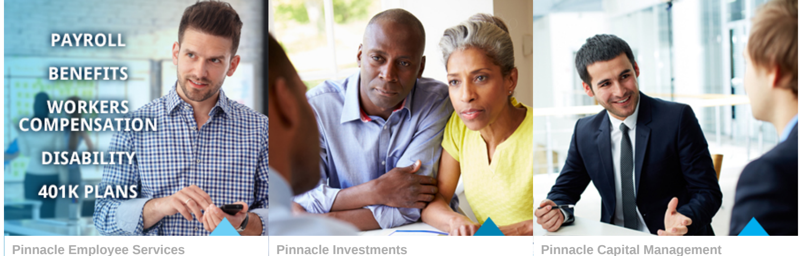
Pinnacle Employee Services