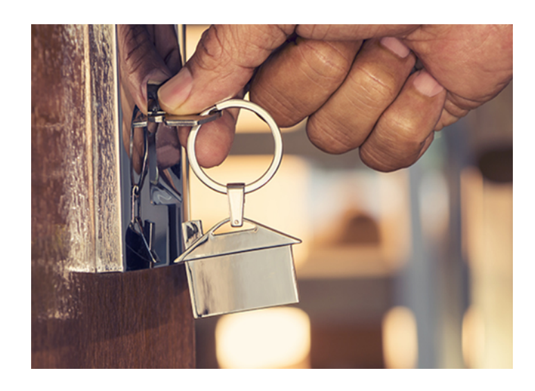
BankWest Mortgage's experienced lenders will connect you with the right home loan at the right rate.