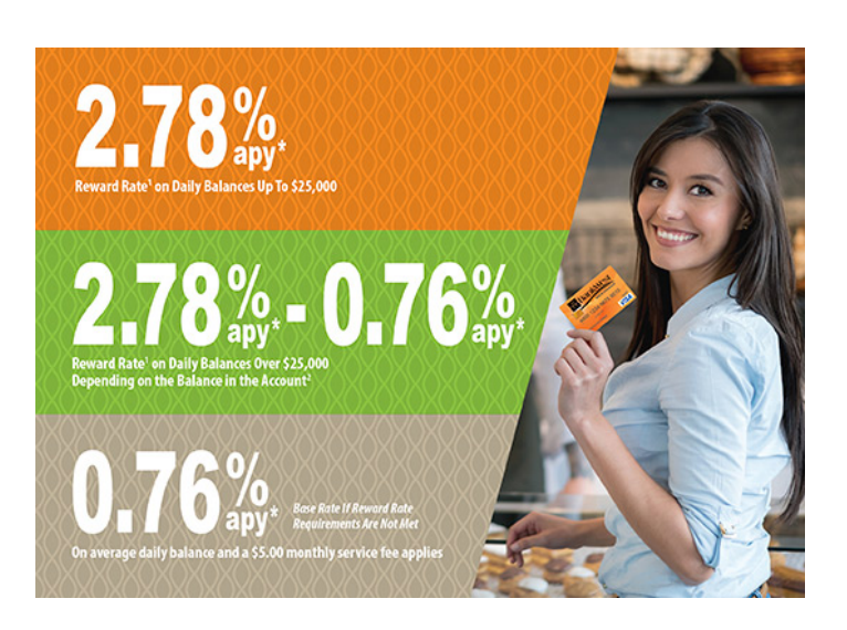
ePlus Checking features reward rates for customers who actively use their debit card