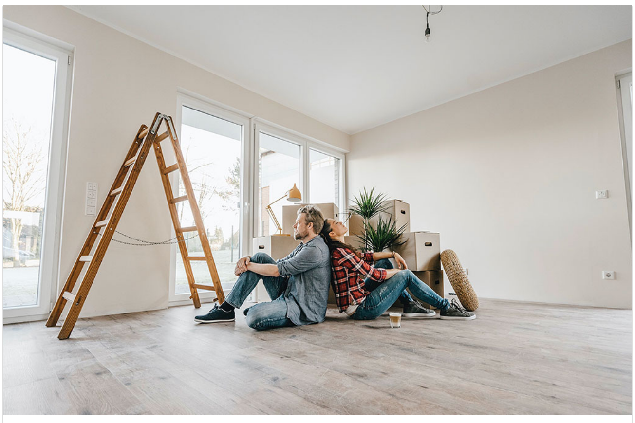
\begin{tabular}{ll} \textbf{Protect More} & \textbf{Discover what life insurance offers for both your family's future and your own. } \end{tabular}

Lifetime Income Use your savings to generate income to give you the retirement you want.