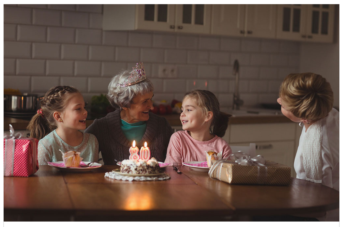
Your Future Won't Wait for You Start a retirement plan now that lasts as long you'll need it.

(https://www.prudential.com/financial-education/life-events/retire?intcmp=pru-hp-doormat)