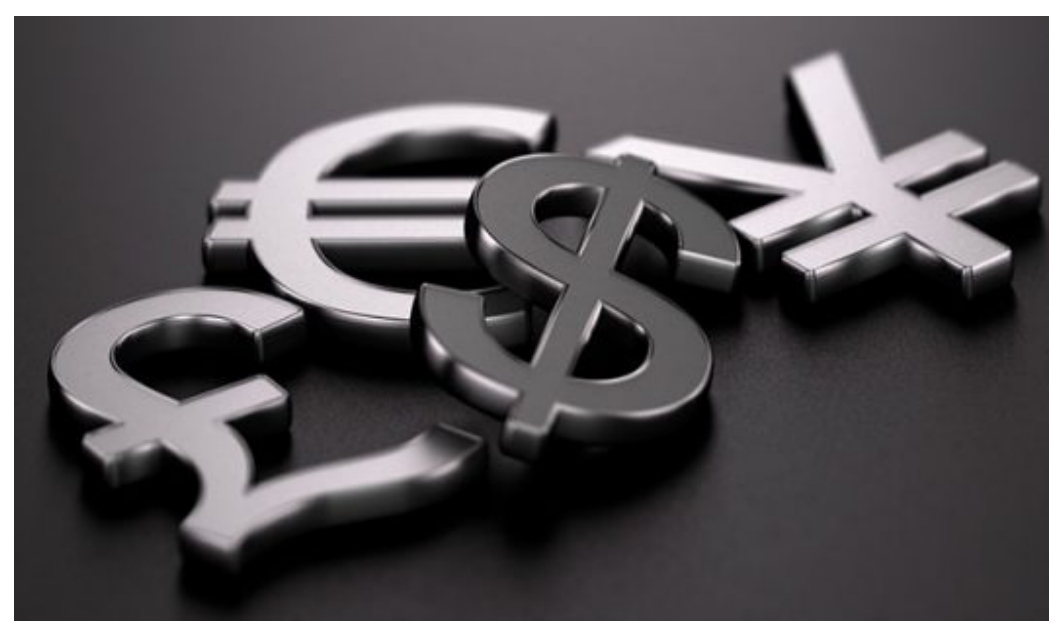
(https://popularone.com/why-should-you-diversify/) June 18, 2019 | Investments (https://popularone.com/category/investments/)

When things seem unsettled, follow a timeless advice from a trio of investment gurus. Their wisdom is especially appropriate amid current turbulent circumstances. On the other hand, the variables change, but crises and problems always occur and, at least temporarily, they affect markets. Here's some food for thought from three... Learn more » (https://popularone.com/timeless-investment-wisdom-from-3-gurus/)