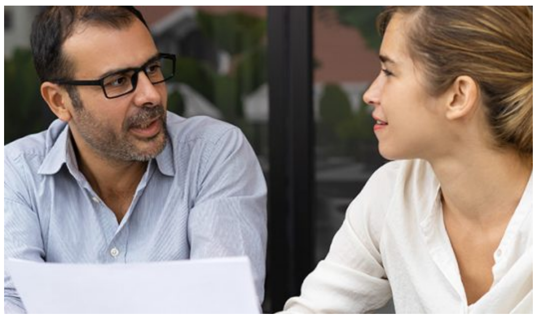
(https://popularone.com/timeless-investment-wisdom-from-3-gurus/) June 18, 2019 | Investments (https://popularone.com/category/investments/)