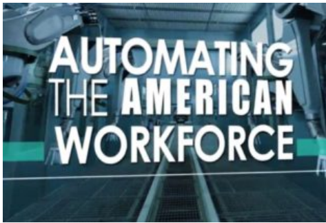
Automating the American Workforce