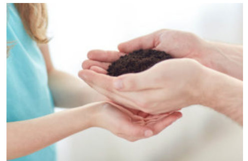
Back to Basics: Diversification and Asset Allocation