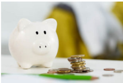
Investing in Bonds