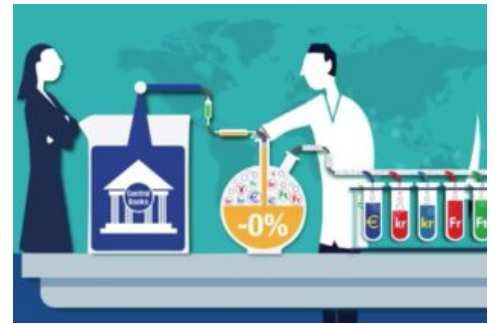
Below Zero: The World Experiments with Negative Interest Rates