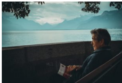
Building Confidence in Your Strategy for Retirement