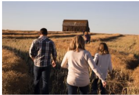
Protect Your Heirs by Naming a Trust as IRA Beneficiary