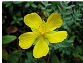
Hypericum olympicum flower