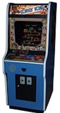
Donkey Kong arcade game