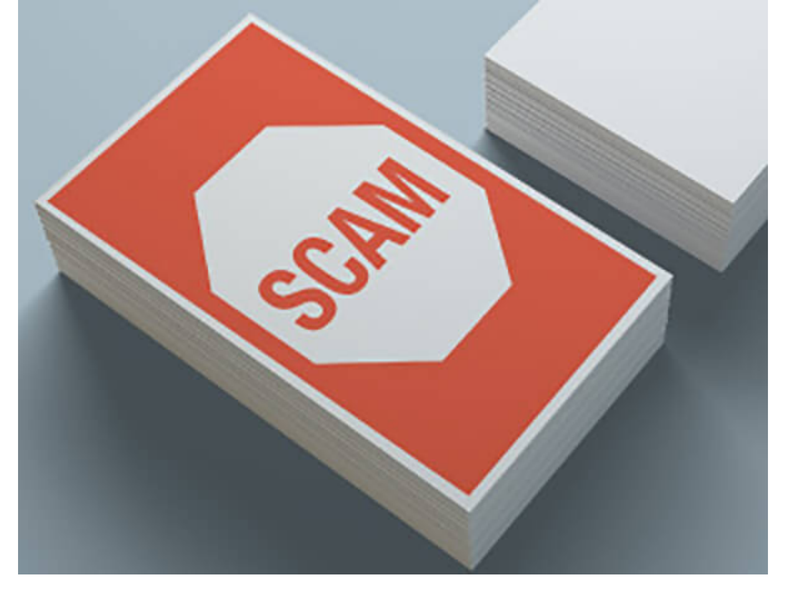
"Dirty Dozen" Tax Scams to Watch For

Every year the IRS releases its list of tax scams, spotlighting some ways that people try to separate you from your money.