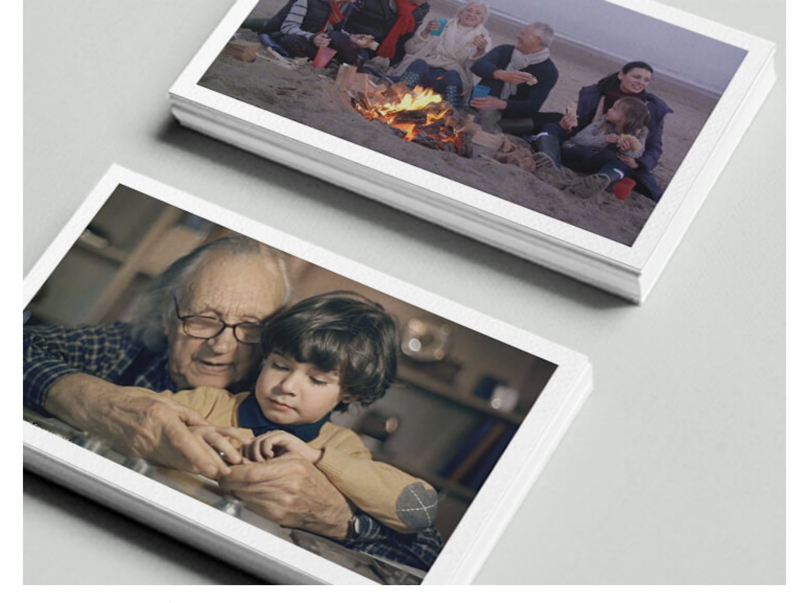
18 Years Worth of Days

The average retirement lasts for 18 years. Are you prepared to fill that many days?