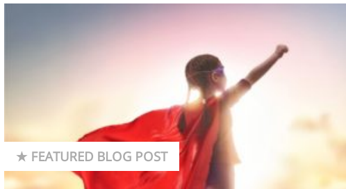
★ FEATURED BLOG POST