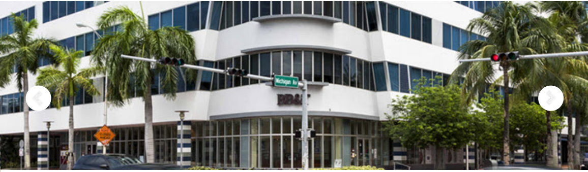
The Lincoln, Miami Beach, FL