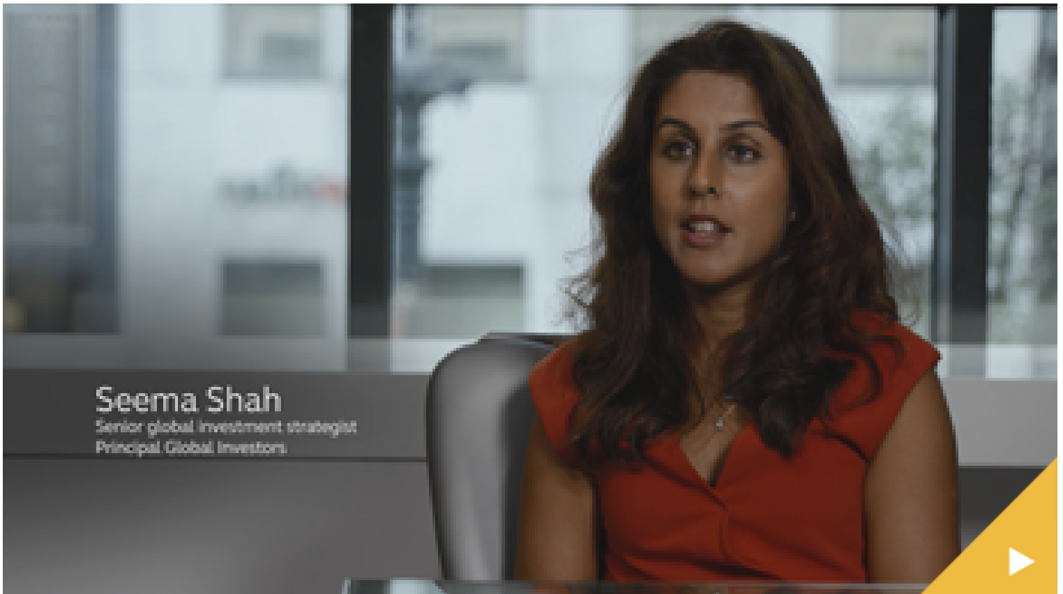
Principal Global Perspectives: Brexit negotiations